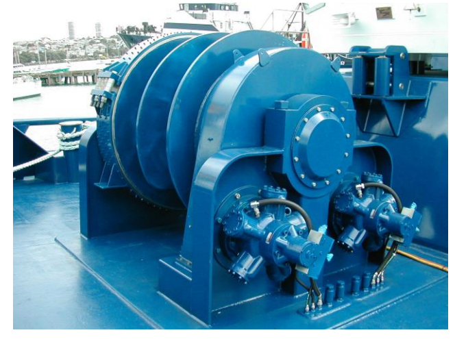
Model MW12 1D120BR: 12t drum winch, 20m/min, 120t brake

A winch is only as strong as the deck that it is attached to and the structure below it. Applying MID's experience as naval architects we can predesign the full structural foundation package to be built and installed with the winch. The required foundation can be pre-fabricated and be ready to be inserted into the existing structure of the ship, reducing both the vessel's downtime and costs.