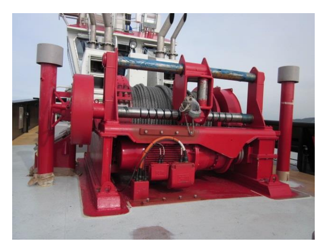
Model MW12 1D80BR: 12t drum winch, spooling, 20m/min, 80t brake

MID has extensive design experience over a wide range of different types of winches, windlasses and capstans, and across many sizes and different applications for different types of vessel.